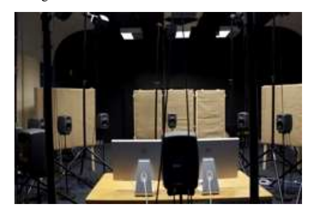
Figure 1: SpADE Lab

The Spatial. Audio. Display. Environment or SpADE, is a 28-channel surround sound system set up in the University of Limerick. This system can be used for many things involving spatial sound such as psychoacoustic testing, prototype design and scientific research making it perfect for performing an informal user test in form of a pilot study. Even though a pantophonic fourteen loudspeaker configuration was available, only the eight-channel octagonal configuration was used.